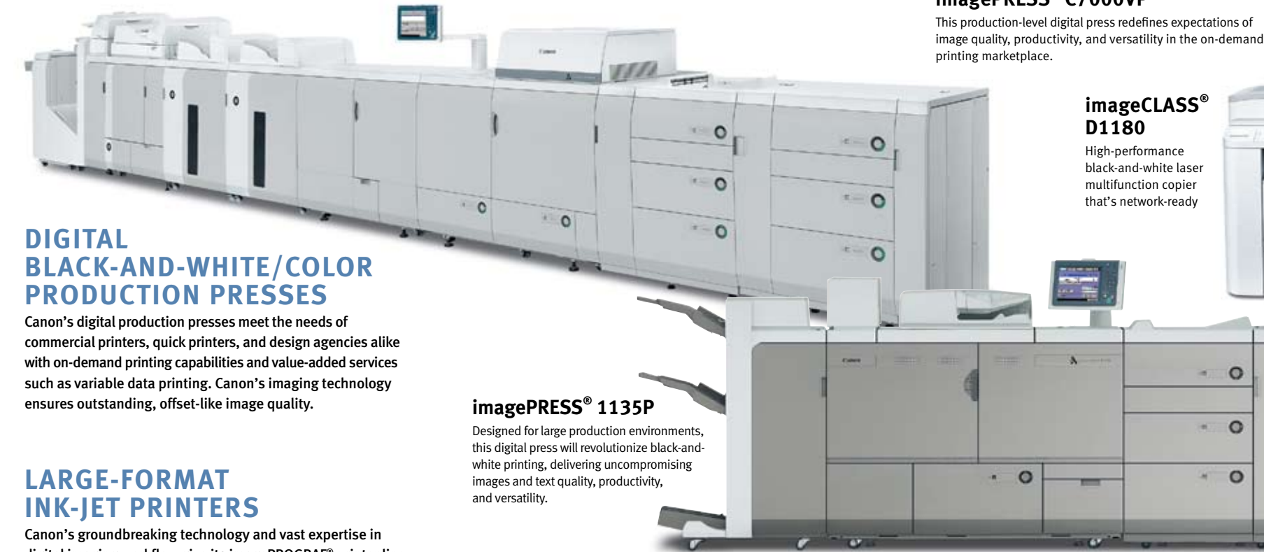
imagePRESS® 1135P Designed for large production environments, this digital press will revolutionize black-and-white printing, delivering uncompromising images and text quality, productivity, and versatility.