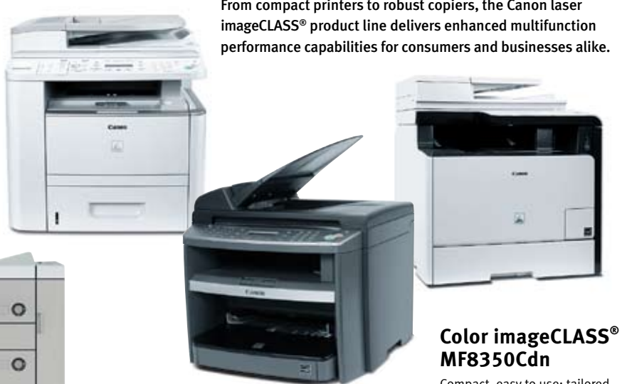
imageCLASS® MF4370dn An affordable desktop and network-ready solution for the small office

From compact printers to robust copiers, the Canon laser imageCLASS® product line delivers enhanced multifunction performance capabilities for consumers and businesses alike.