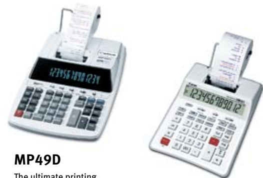
MP49D The ultimate printing calculator: 14 digits, prints 5.2 lines/second, extra-large fluorescent display

Canon's printing calculators incorporate high-speed, two-color printing and easy-to-use keys that automatically perform complicated applications, all in an attractive design.