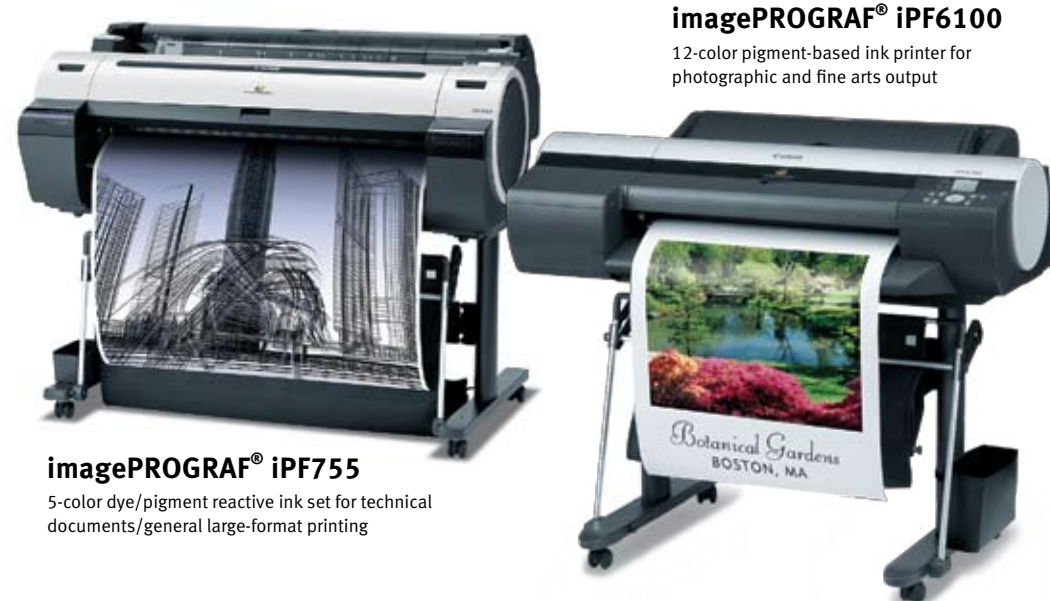
imagePROGRAF® iPF755 5-color dye/pigment reactive ink set for technical documents/general large-format printing

Canon's groundbreaking technology and vast expertise in digital imaging workflow give its imagePROGRAF® printer line the output quality and performance to satisfy even the most demanding professionals. From 17" to 60", Canon has the large-format printer to fit your needs.