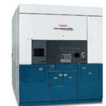
FPA-6000ES6a KrF photolithography system supports high-volume manufacturing of semiconductor devices. The ES6a scanning stepper utilizes Canon's Advanced Flexible Illumination System (AFIS) to resolve 90 nanometer features.

Canon continues to support leading-edge industries.