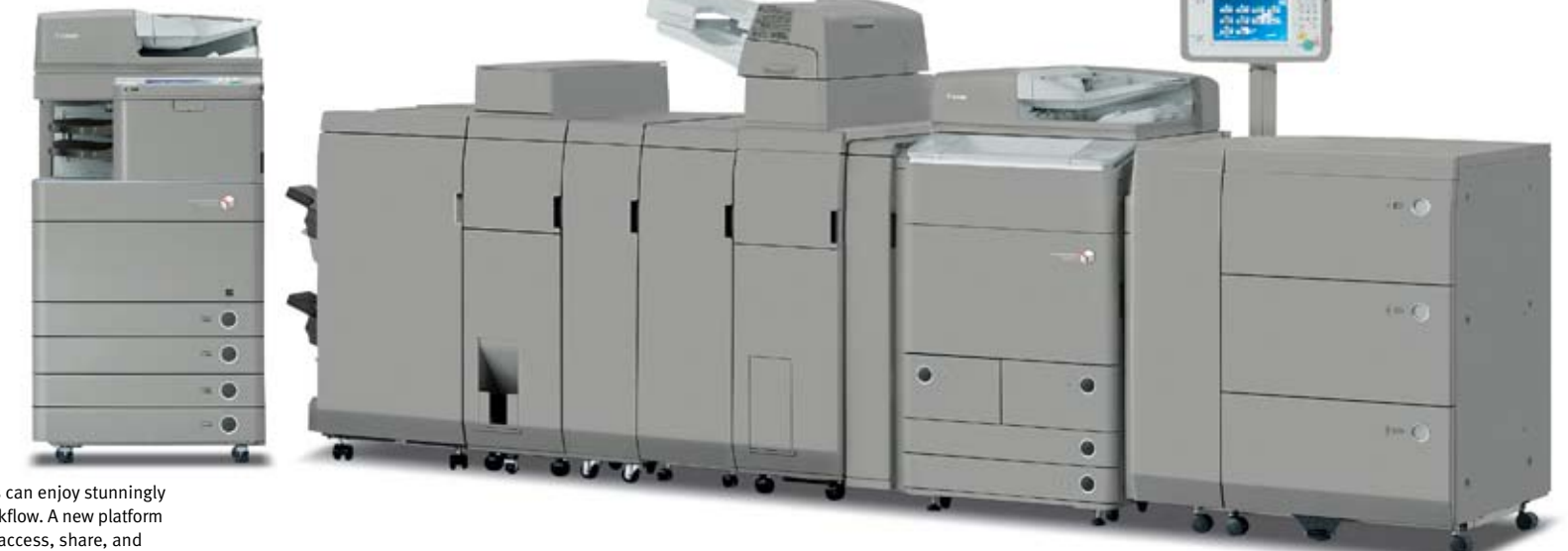
imageRUNNER® ADVANCE C5051* Departments and workgroups can enjoy stunningly simplified and productive workflow. A new platform redefines how your team will access, share, and manage communication.

Canon's multifunction solutions complement office and light production environments with cutting-edge solutions to advance your business today and tomorrow. Each delivers high-speed output in brilliant color and/or black and white, plus advanced paper handling, professional options, and robust functionality.