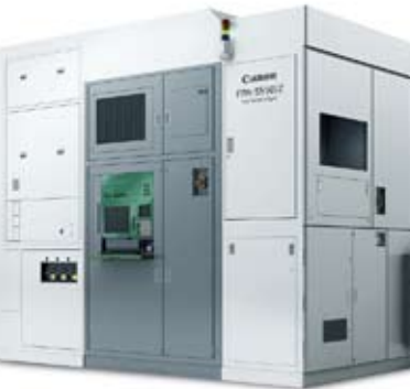
FPA-5550iZ This i-line stepper provides world-class throughput in a cost-effective photolithography system. The 50iZ features a 3.0G acceleration stage that enables 180 wph throughput and 280 nanometer resolution.