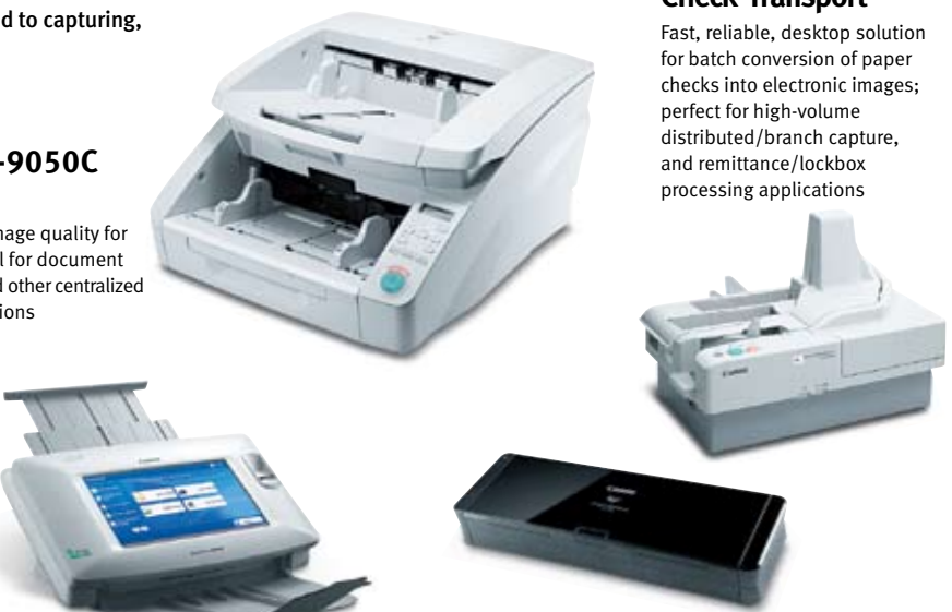
imageFORMULA® P-150 Personal Scanner Mobile, easy-to-use, small, high-value solution — just plug-and-scan to improve personal efficiency and productivity, ideal for "road-warriors" and general distributed scanning applications