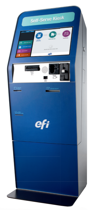
G5 Card Vending Kiosk