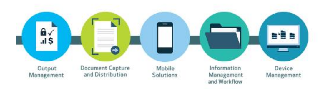
Figure 6: Key Areas of Print/Document Software Developed by Canon

The ability of one service provider to efficiently and effectively maintain and repair print infrastructure components can really cut down on the waiting and complication that may be involved with using multiple providers for different purposes. Another benefit of this scenario is that because the various technology components are optimized for one another, fewer problems are likely to occur in the first place. In addition, Canon authorized partners may be capable of servicing non-Canon devices and solutions that are part of a customer's fleet.