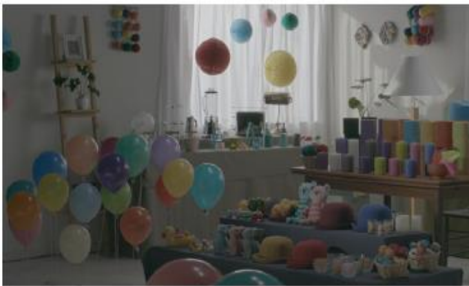
Canon Log 2