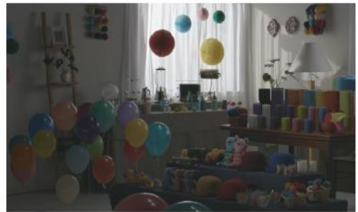
Canon Log 3